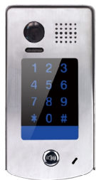
DORVT13 Integrated Keypad Surface